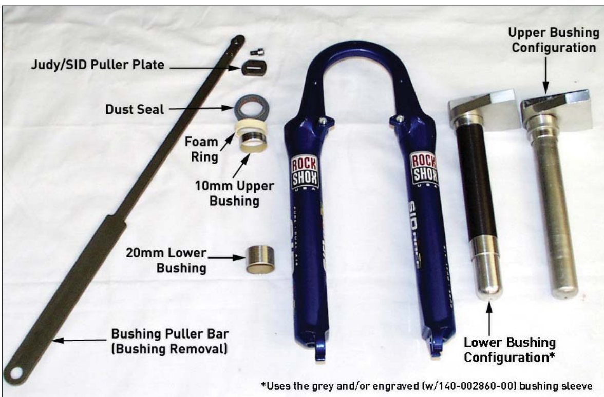
Judy/SID Short Lower Leg Bushing Tools and Configuration