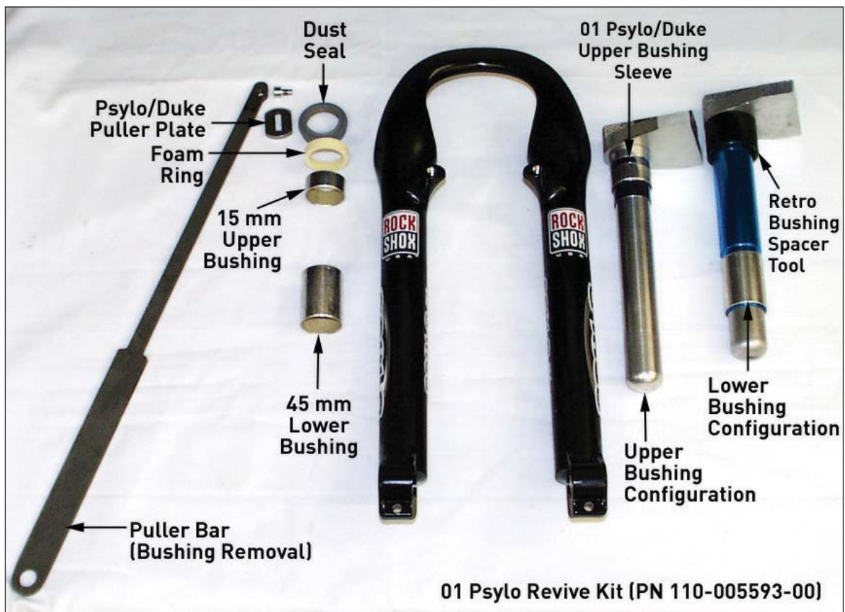
01 Psylo Revive Kit (PN 110-005593-00)