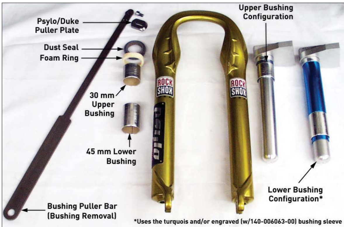
2002 Psylo Lower Leg Bushing Tools and Configuration