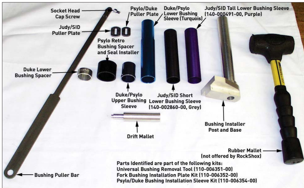
Bushing Tools Overview