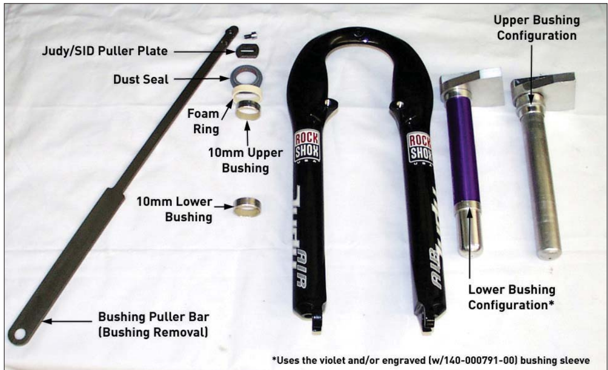
Judy/SID Tall Lower Leg Bushing Tools and Configuration